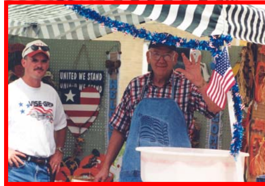
Hometown Perry, Iowa Archives

8:00 7th Annual Miller Walk, Run, or Roll 9:00 Food & beverages, arts & crafts, etc...in Pattee Park 10:00 Parade 11:30 Horse Shoe Tournament 12:00 Water Balloon Fights, Frog Creek "Duck Race" 12:30-2:00 Al Welsh Orchestra 1:00 Perry Fire Dept. water fights, Bingo by Perry Elks 2:00 Perry Fine Arts Ice Cream Social 2:30 Comedian/Illusionist 4 :00 Bill Riley Talent Show 6:30 Live Band - "Pocket Full of Nickels" 9:45 FIREWORKS!!!